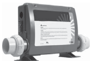
This document covers VS and GS systems 500DZ through 520DZ with Balboa Panels VL801D or VL802D. http://www.balboawatergroup.com/

When the spa is first powered up, the words SET TIME will flash on the display. Press “Time,” then “Mode/Prog,” then “Warm” or “Cool.” The time will begin changing in one-minute increments. Press “Warm” or “Cool” to stop the time from changing. Press “Time” to confirm.